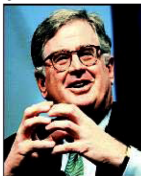
Indian IT firms are very good at what they do, says Palmisano

Palmisano, 59, was in Bangalore to deliver the IISc Centenary Lecture. IISc started this lecture series two years ago when it celebrated its centenary year-